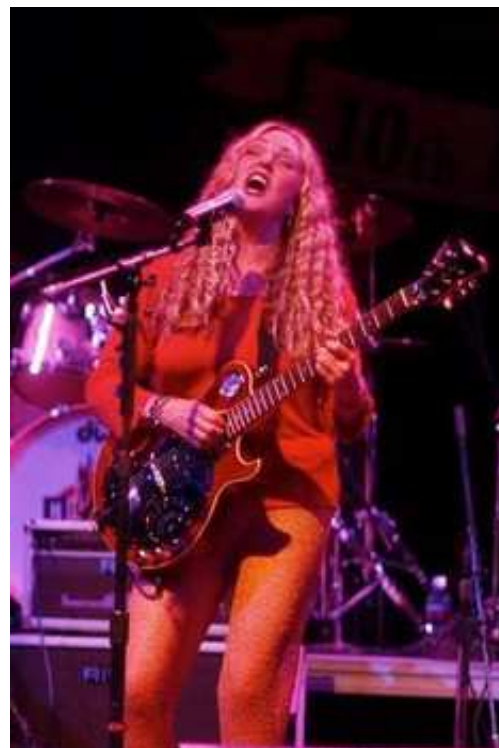
Question 3 PEACH

My name is Phoenix and . . . that's the bottom line.